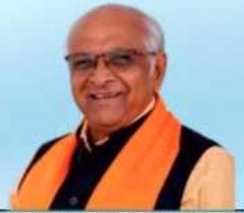
Shree Narendra Modi - Prime Minister of India